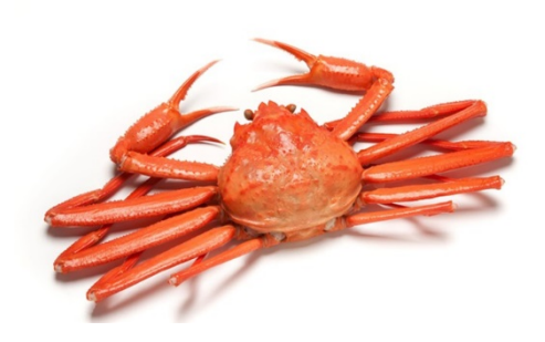
Red Snow Crab (Chionoecetes japonicus Rathbun)

This month's new certification was one for fishery, four for aquaculture, and one for CoC - the total of six cases. In the fishing industry, the Sea of Japan Crab Pots Fisheries Association gained the certification for the red snow crab fishery. It is the first time that the old MEL certification had been once expired, but the new MEL certification was applied and approved. Although the Sea of Japan is being tossed by